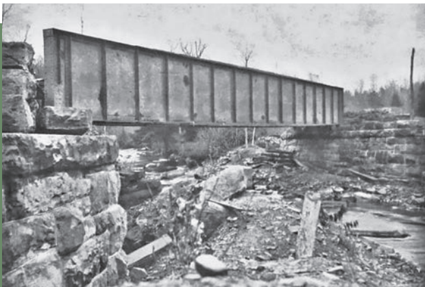
WB&E Railroad bridge crossing Pocono Creek, circa 1894

The name "Rail Gap" comes from the Wilkes-Barre & Eastern (WB&E) Railroad, which transported coal, ice, and passengers between Wilkes-Barre and Stroudsburg from the 1890s to the 1930s. The former railroad bed is now part of the white trail, with a distinct "gap" where the trail meets Pocono Creek. A stone cliff is all that's left of the railroad bridge that once crossed the flowing water. Any trace of the opposite bridge support has disappeared due to time, floods and the rerouting of Pocono Creek to build Route I-80.