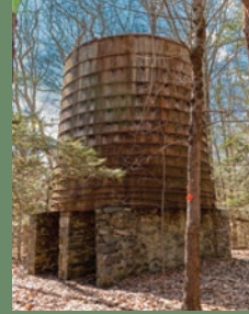
Historic wooden water tower.

An abandoned old car? Curious. A water tower, made of wood ? It's true! Although the history of the water tower and other artifacts are unknown, even more surprising is that wooden water towers are still manufactured today – so lightweight they're sometimes used on city rooftops. Because the wood swells when the tower is filled with water, no nails or adhesive are necessary; the steel bands that encircle the wooden planks allow it to be tightened as needed. The water tower, a vintage 1920s car, and an assortment of antique farm equipment are all on the western side of the preserve, which can be accessed from the secondary parking lot on Brislin Road.