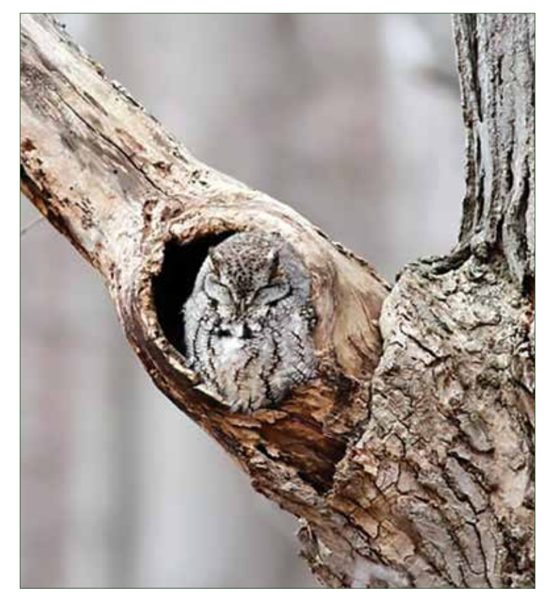
A screech owl enjoying a long winter's nap.

Red foxes, coyotes, possums, bobcats, and many other creatures travel these woods in