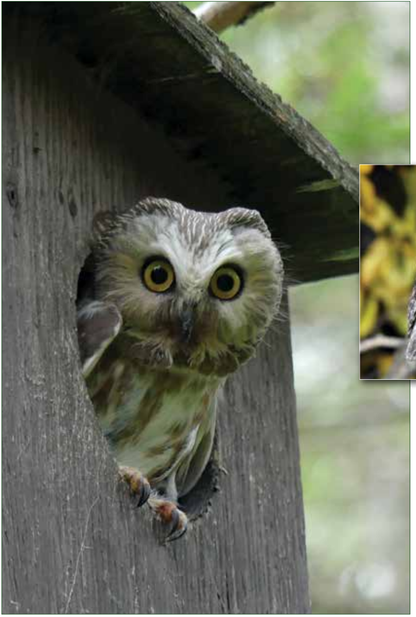
The tiny northern saw-whet owl weighs less than a small peach. (Contributed photo)

A story for children and their grownups about the owls in Pocono woodlands ... protected by Pocono Heritage Land Trust