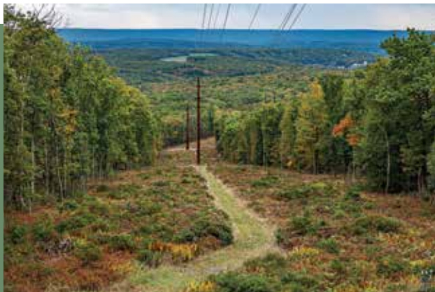
View from Jonas Mountain

A short distance from the parking lot, a powerline clearing presents beautiful views of Blue Mountain. The brushy growth in the clearing provides nesting and foraging areas for field sparrows, prairie warblers, and other birds that are in decline as this type of habitat becomes scarcer in our region.